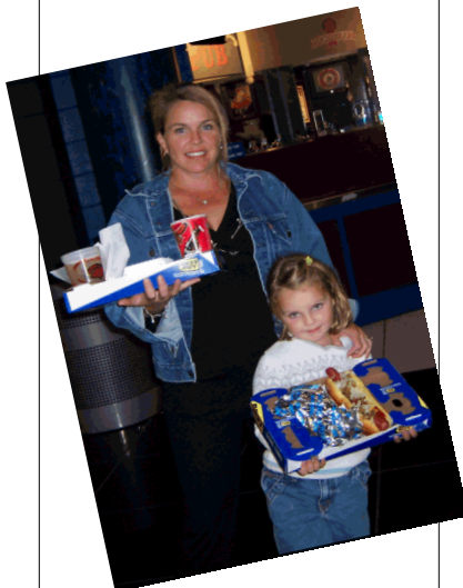
Fun With Mom at Phillips Arena in Atlanta

Mother and daughter head back to their seats with StadiumTRAY during recent NHL Atlanta Thrashers match.